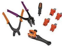
BTB5K Brake Tool Asst $149.99