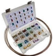
BR-EZ316 3/16" Brake Line Kit $129.99