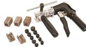
PFT409 Pistol Grip Flaring Tool $299.99