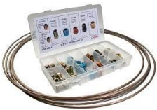
BR-EZ14 1/4" Brake Line Kit $99.99