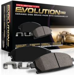
Z17 Evolution Plus Ceramic Disc Brake Pads