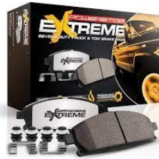
Z36 Extreme Severe-Duty Truck & Tow Carbon & Ceramic Formula Brake Pads

Next Gen Super Premium Euro, Luxury & Performance Passenger Car Upgrades