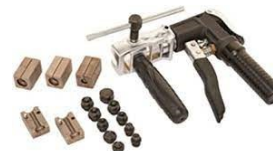
PFT409 Pistol Grip Flaring Tool $299.99