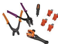
BTB5K Brake Tool Asst $149.99