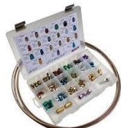
BR-EZ316 3/16" Brake Line Kit $129.99