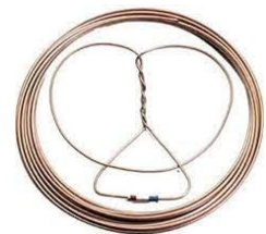
BR-EZ100-5 Ultrabend tubing 50' $94.99

Replacement fittings and adapters in stock to replenish kits!