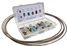
BR-EZ14 1/4" Brake Line Kit $99.14